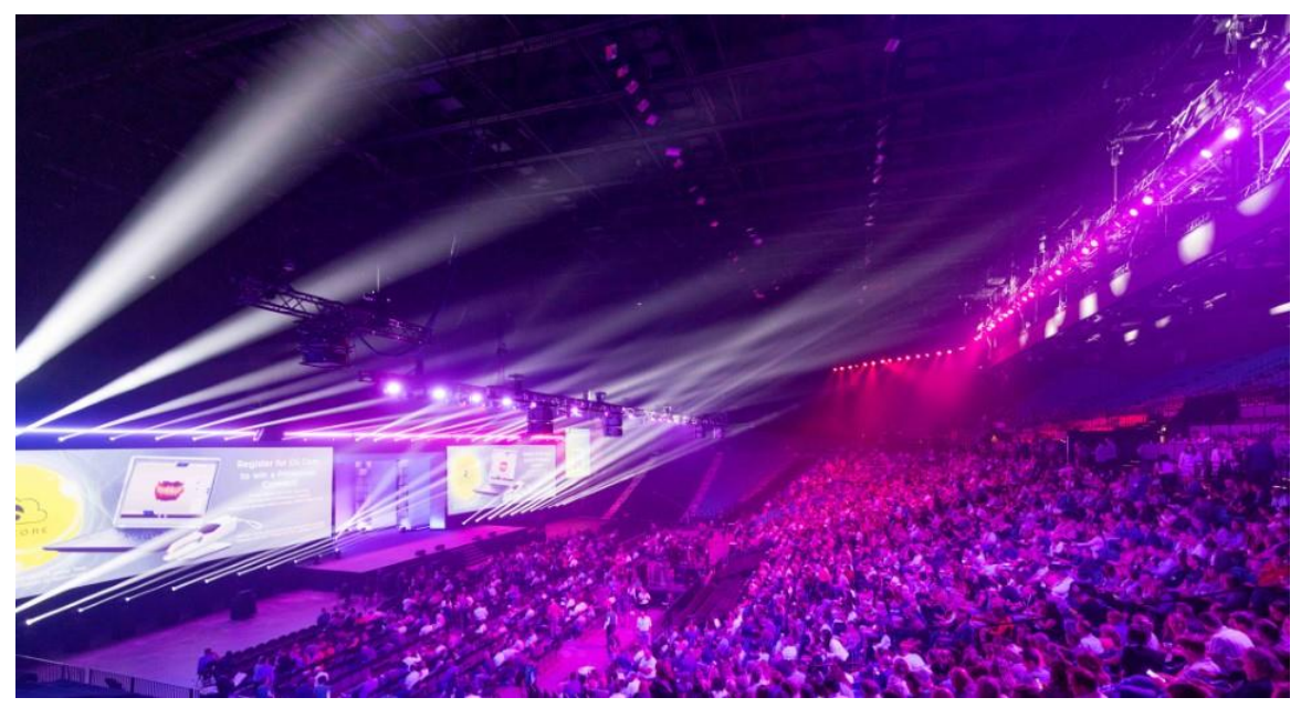
Dentsply Sirona World Las Vegas 2023